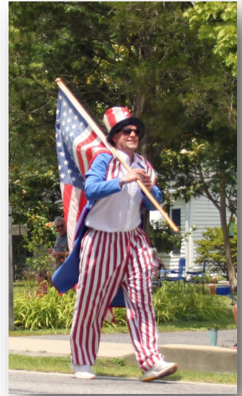
Galesville Parade once again exhibited what is so special about Galesville.