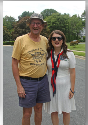
4th of July

The Mission of the Galesville Heritage Society is to: